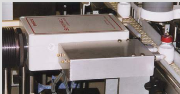
Luminar 3030 Optical Module - Moving Vials Inspection Linked to Cap Color Reader

The Luminar 3030 Free Space process analyzer meets all requirements and standards for on-line applications in the pharmaceutical industry and is built to work reliably even in the toughest environmental conditions. The integrated Luminar 3030 is insensitive to vibrations and ambient light and offers outstanding S/N ratio combined with ultra high speed scanning rates and makes it possible to analyze in real time, on-line and with laboratory accuracy.